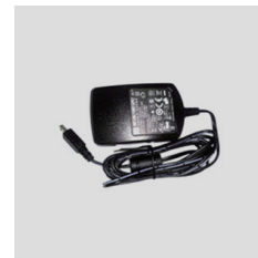
Adapter AC Cable