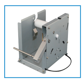
Large Paper Holder