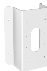
DS-1476ZJ-SUS Corner Mount