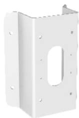
DS-1476ZJ-Y Corner Mount