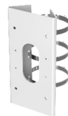
DS-1475ZJ-Y Vertical Pole Mount