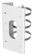
DS-1475ZJ-SUS Vertical Pole Mount