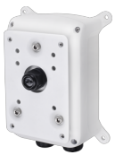
TKH Security JB27 Junction box, for WM01A, WM27 (Preliminary)