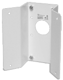
TKH Security WM05 Corner mount, for WM01A, WM27